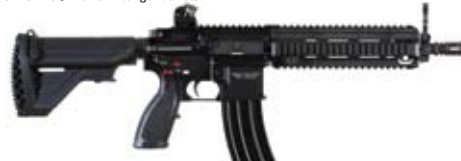
HK416 – with 10.4 inch barrel

With a 10.4 inch barrel, this HK416 variant is handy when operational demands make a short barrel more suitable. Despite its short length, accuracy matches or exceeds competing M4/M16/AR systems with 14.5 inch and longer barrels.