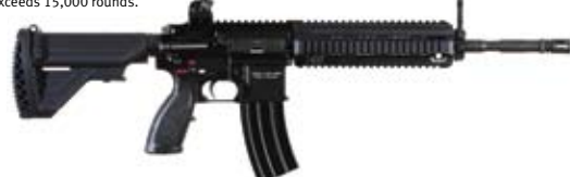
HK416 – with 14.5 inch barrel

The HK416 with 14.5 inch barrel is the variant closest to the M4 carbine. Aside from standard features like the Free Floating (Picatinny) Rail System (for optimal accuracy), barrel service life exceeds 15,000 rounds.