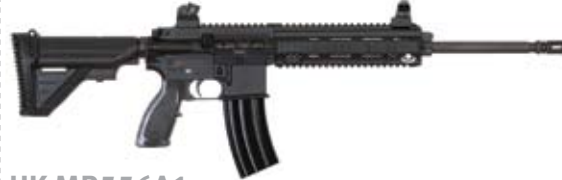
HK MR556A1 – semi-automatic with 16.5 barrel

The MR556A1 is a semi-automatic variant of the HK416. Well-suited as a law enforcement patrol carbine, the highly accurate 5.56 mm MR556A1 is commercially available in most U.S. states.