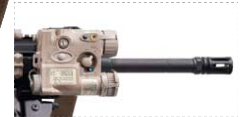
AN/PEQ-16 Integrated Pointer Illuminator Module (IPIM) and other accessories can be easily mounted on the Free Floating Rail System

M16 style flash hider installed on 16.5 inch chrome-lined cold hammer forged barrel