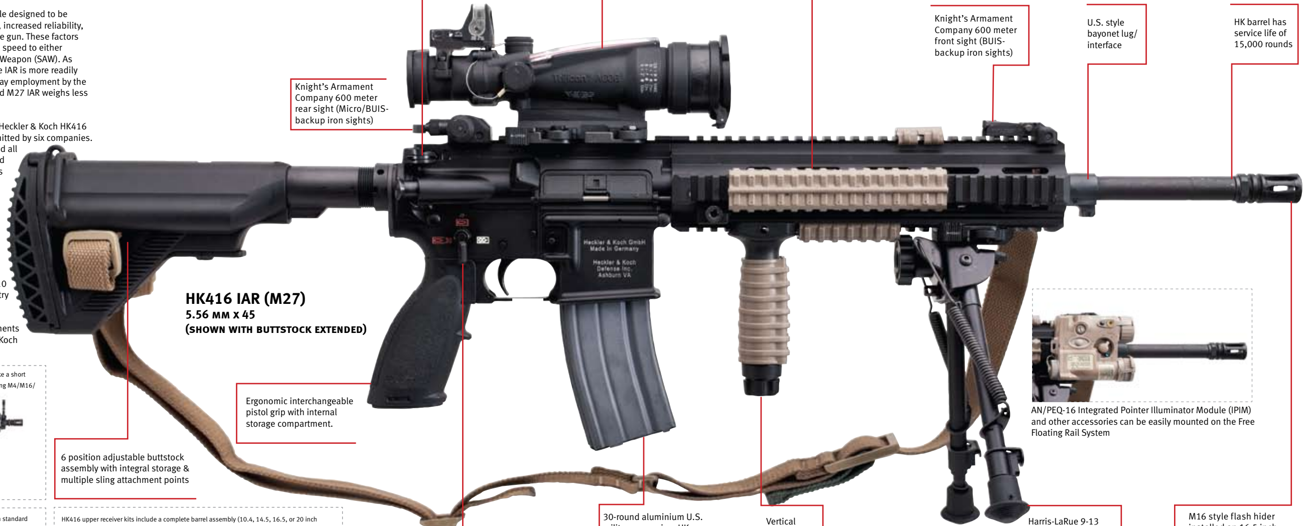
HK416 IAR (M27) 5.56 MM x 45 (SHOWN WITH BUTTSTOCK EXTENDED)

Knight's Armament Company 600 meter rear sight (Micro/BUIS-backup iron sights)