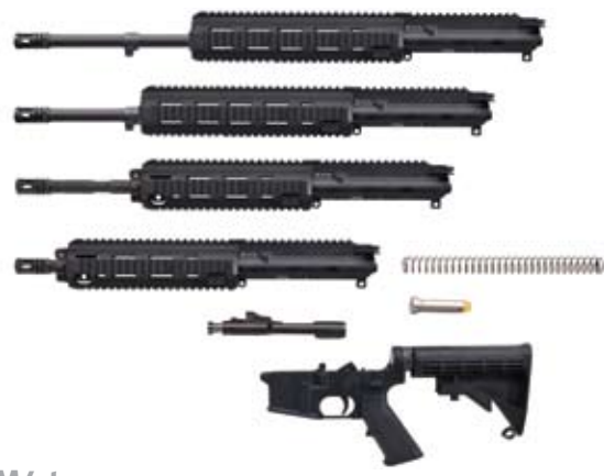
M4 type – with HK416 upper receiver kits

HK416 upper receiver kits include a complete barrel assembly (10.4, 14.5, 16.5, or 20 inch barrels), bolt assembly, and buffer with buffer spring and allow existing M4/M16 systems to be easily retrofitted to HK's ultra-reliable pusher rod operating system.